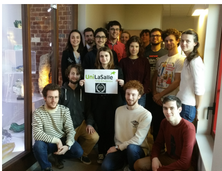
Members of the UniLaSalle-France Team

We look forward to seeing you at the Cocktail Reception at 3:00 pm.