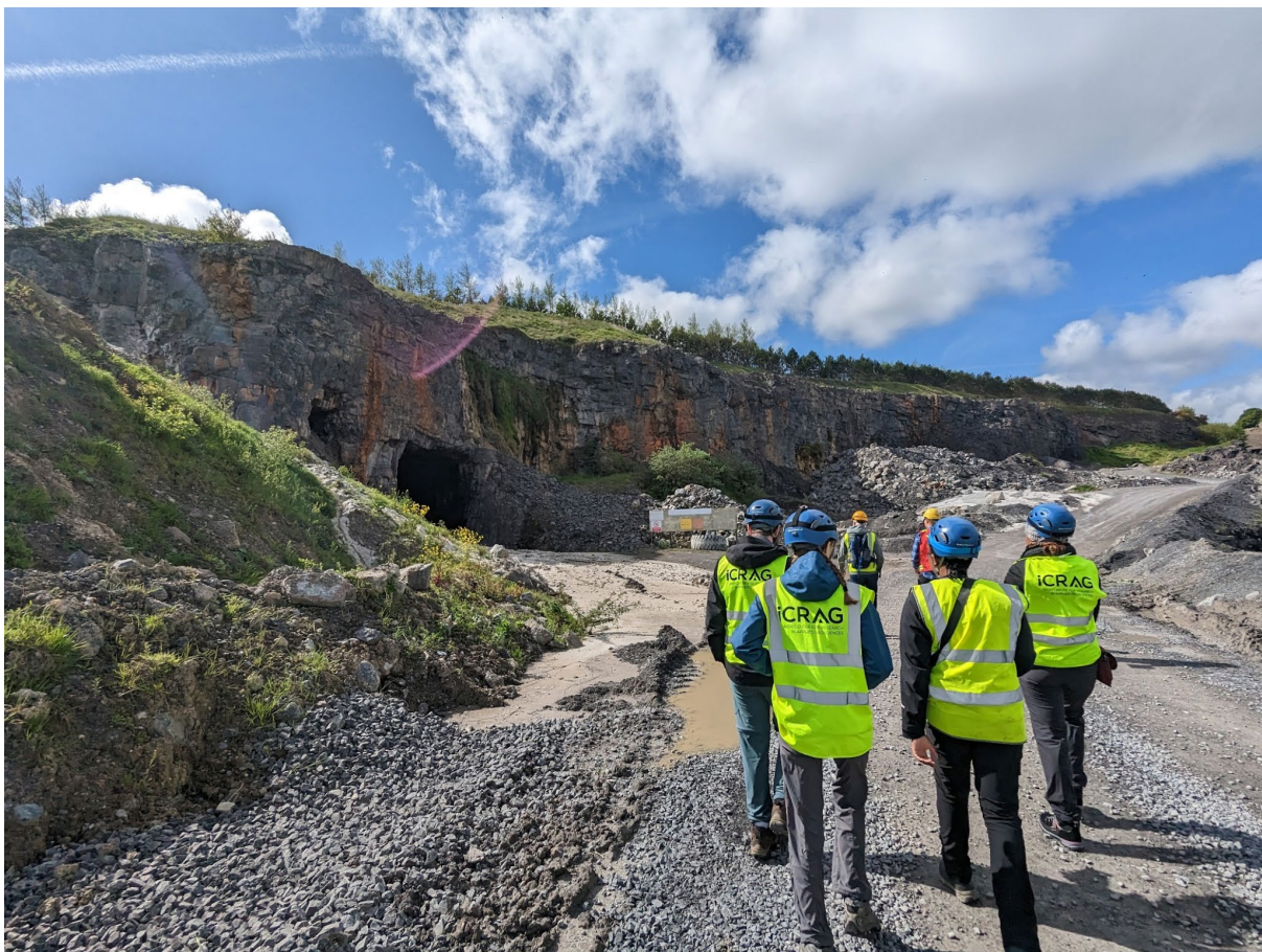
Figure 10: MUN-SEG and NUI-SEG visiting Abbeytown mine. Image shows the open pit quarry with the mine adit visible to the left of the posted signage.

In the afternoon, we visited the Marble Arch Cave in Northern Ireland. Much like the Aillwee and Doolin caves, wall rock consists of limestone that formed ~330 Ma when Ireland was covered by a tropical sea. The cave system's 11.5 km length makes it an impressive example of karsting.