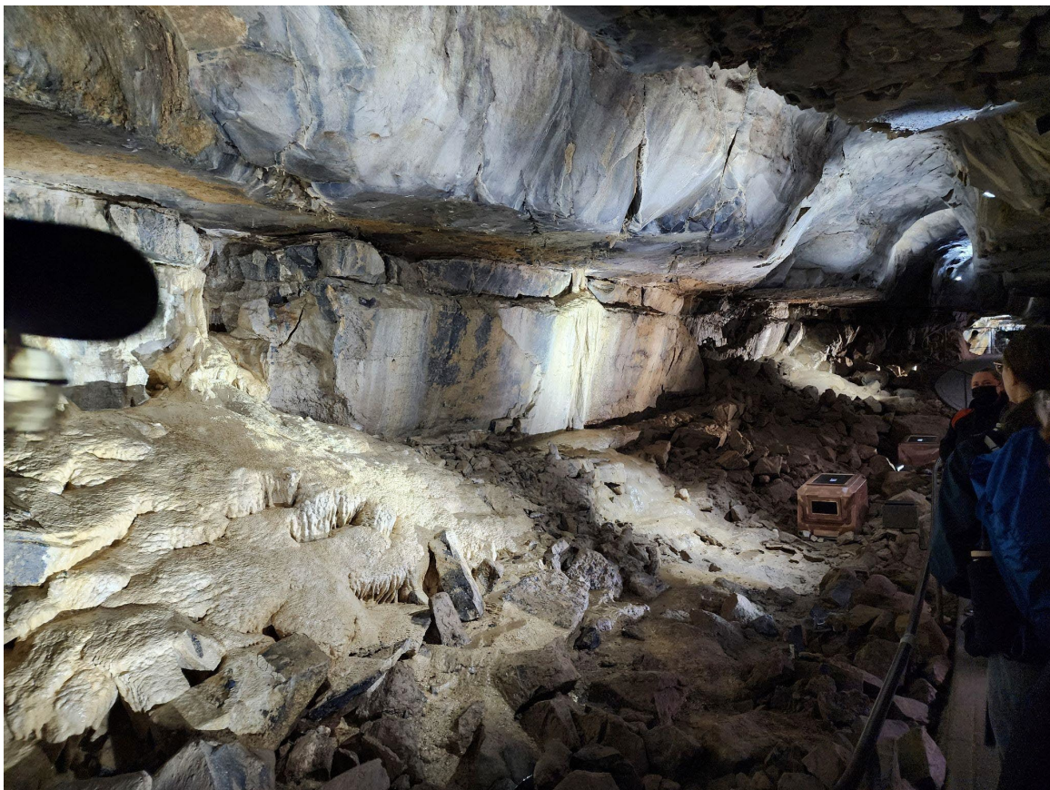
Figure 6: Aillwee Caves located in the limestone karst landscape of the Burren, County Clare, Ireland.

Our main cultural stop of the day was the Rock of Cashel, a prominent landmark which hosts a historically significant and well-preserved medieval cathedral and castle.