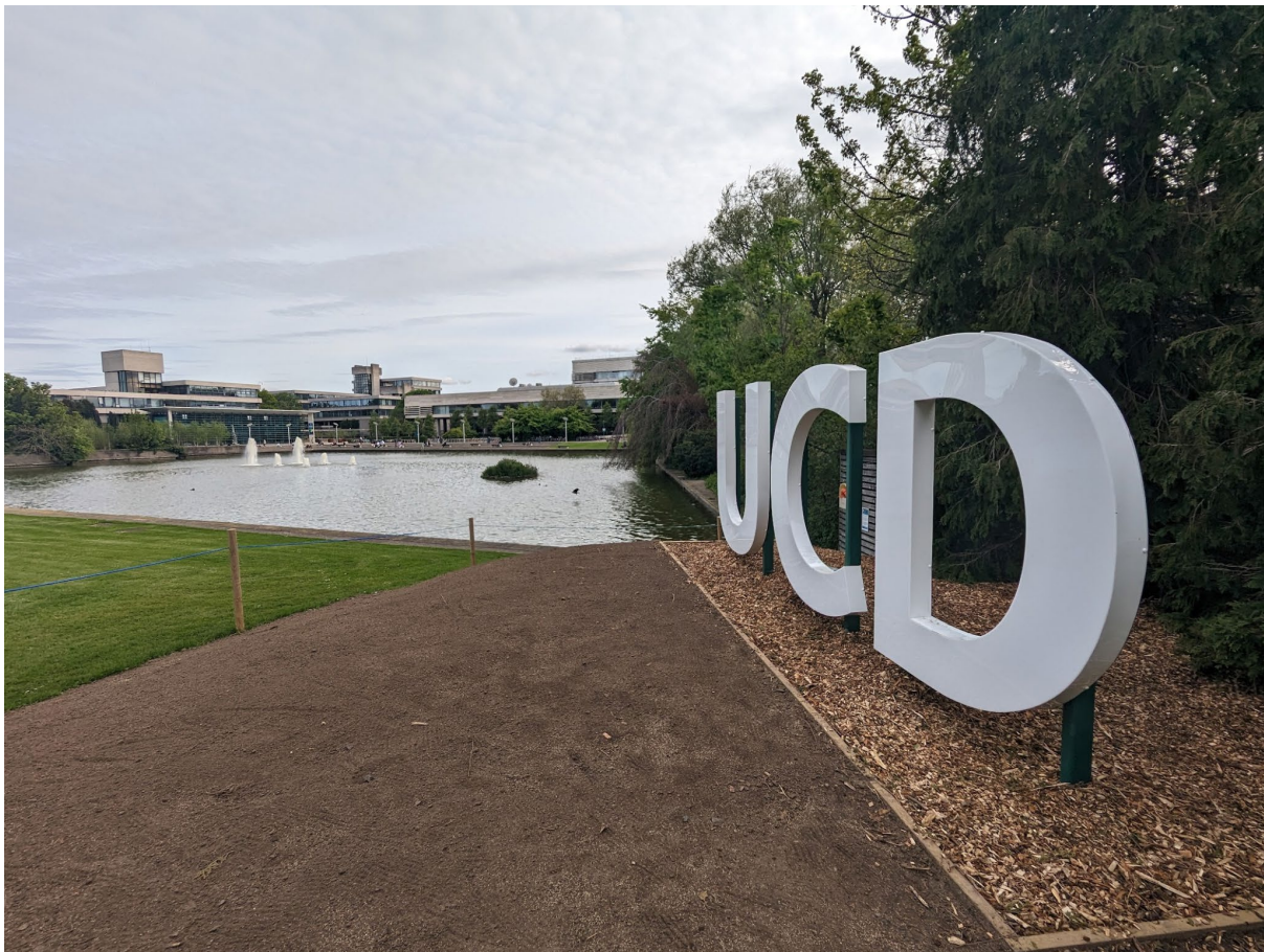
Figure 1: University College Dublin (UCD) campus: venue for the iCRAG-DOME mini symposium on critical metals.

Immediately upon arriving in Dublin, we headed to the School of Earth Sciences at University College Dublin (UCD) for the iCRAG-DOME mini symposium on critical metals. This short symposium was a research exchange forum on critical metals and their mineral deposits with the aims of improving knowledge on the formation and enrichment of these metals and their importance for the green energy transition. We received talks from students and faculty from Trinity College, University of Dublin, University of Erlangen-Nürnberg, University of Mainz, University of Tübingen, and the University of Hannover. Afterwards, there was a networking opportunity where we had the pleasure of meeting students and faculty from these universities.