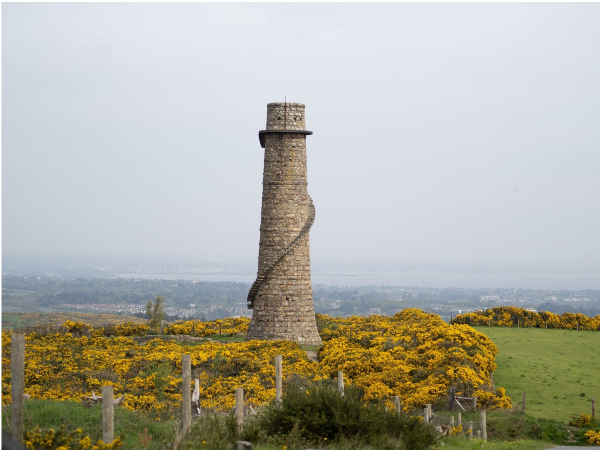
Figure 2: Exhaust chimney preserved at the historic Ballycorus Pb mine, County Dublin, Ireland.