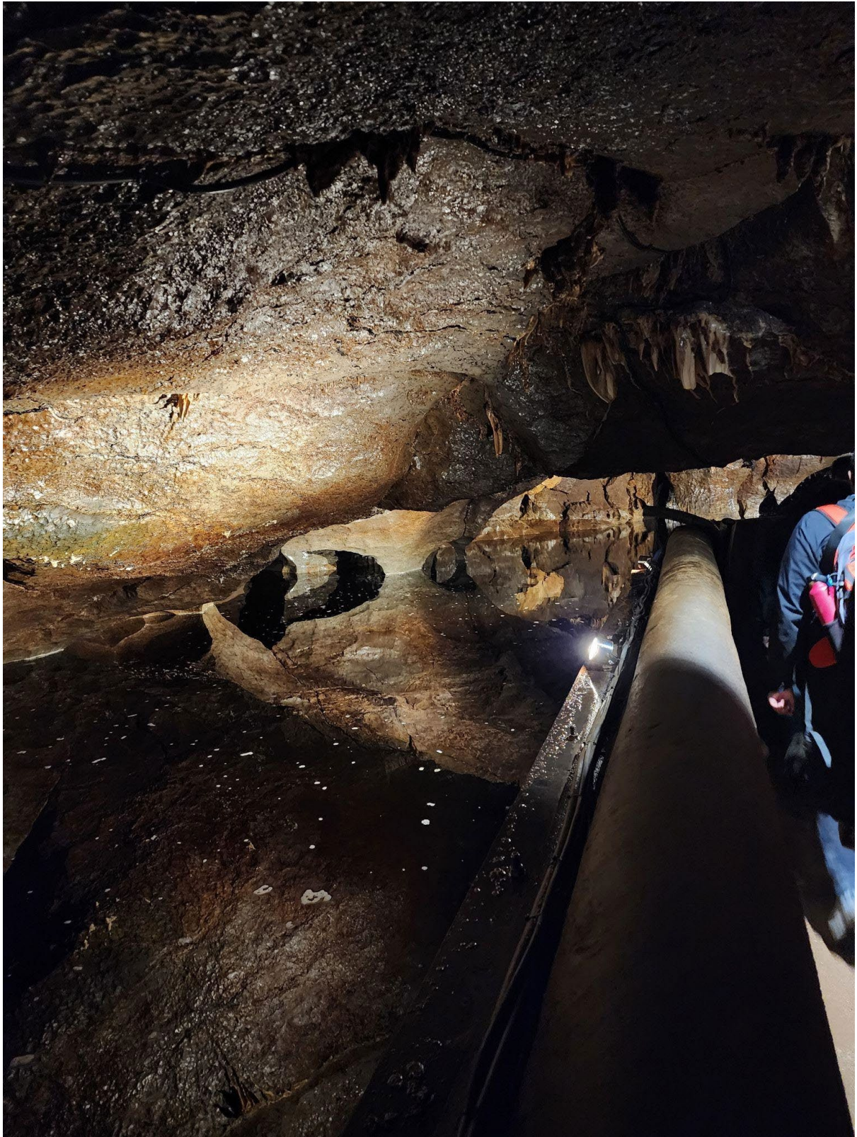
Figure 11: Marble Arch Cave tour through a partially flooded area.