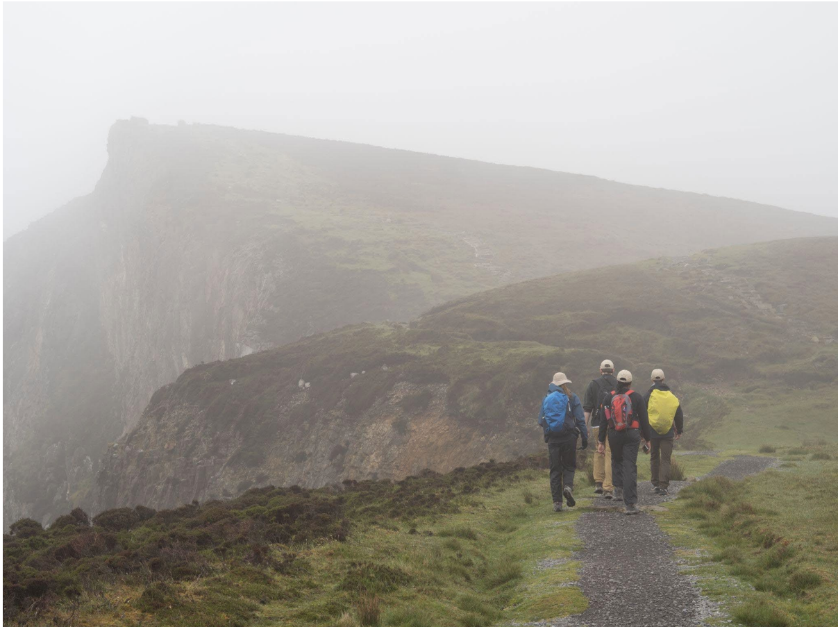
Figure 13: MUN-SEG students hiking Slieve League.