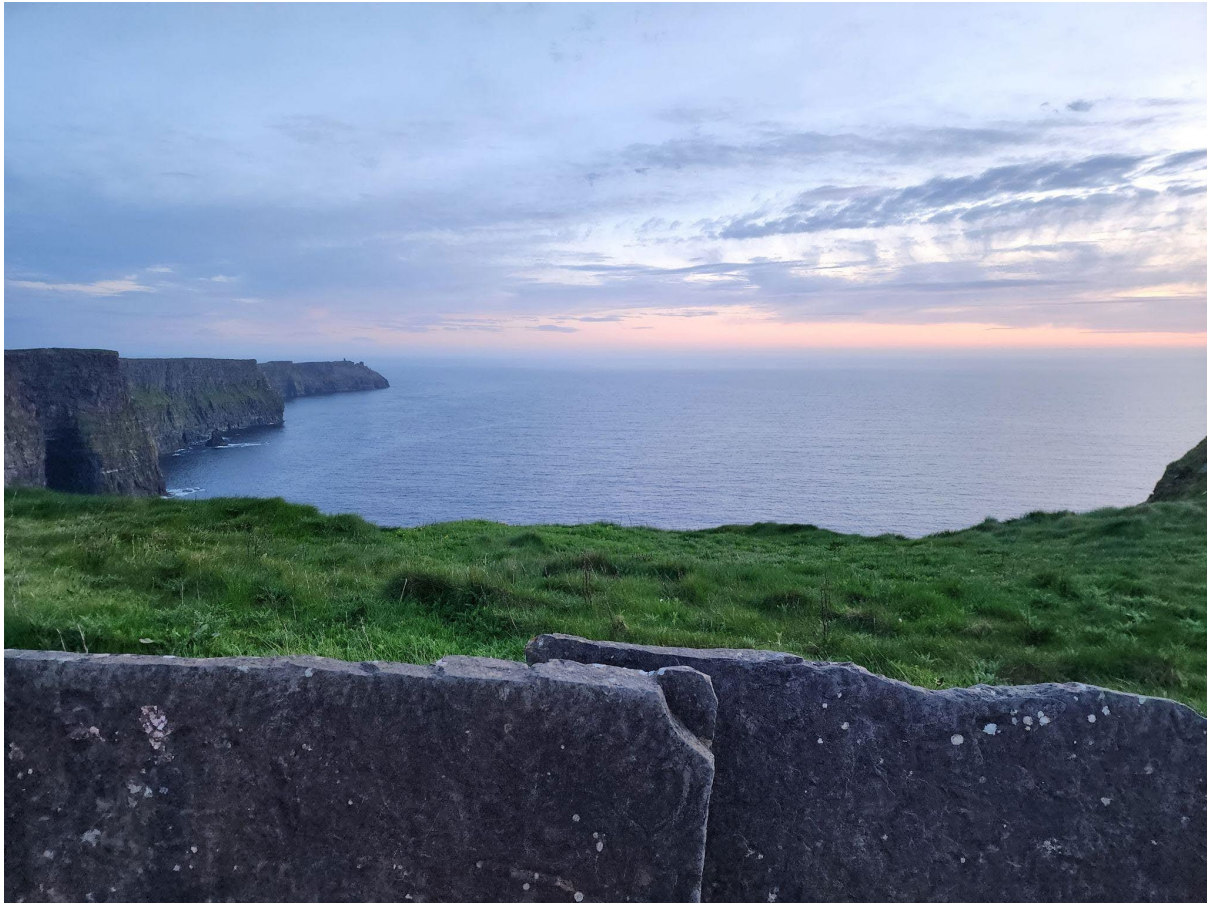
Figure 8: Cliffs of Moher after a long day of exploration.

Day 5: Galway, Glengowla historic Pb mine tour , Sky Road loop, Kylemore Abbey , Connemara National Park (May 6, 2023)