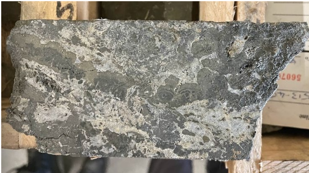
Figure 4: Colloform pyrite and sphalerite mineralization in core from the Galmoy deposit.