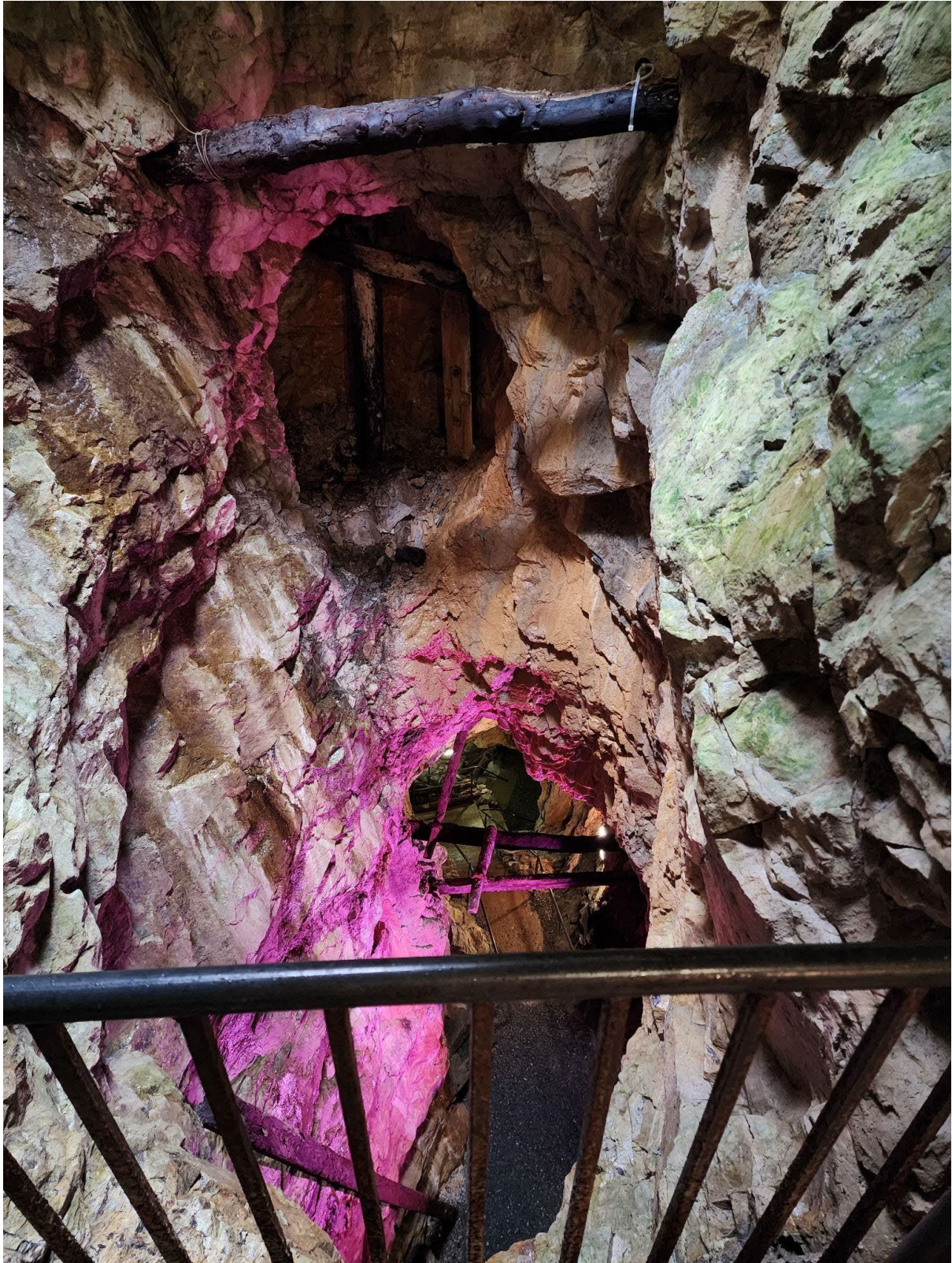
Figure 9: Historic Glengowla Pb-Zn-Ag mine. Miners excavated shafts by hand in pursuit of a galena-bearing vein.

sedimentation in addition to subaqueous volcanic activity (e.g., pillow basalts, tufts, etc). The drive through Maam Valley was particularly memorable.