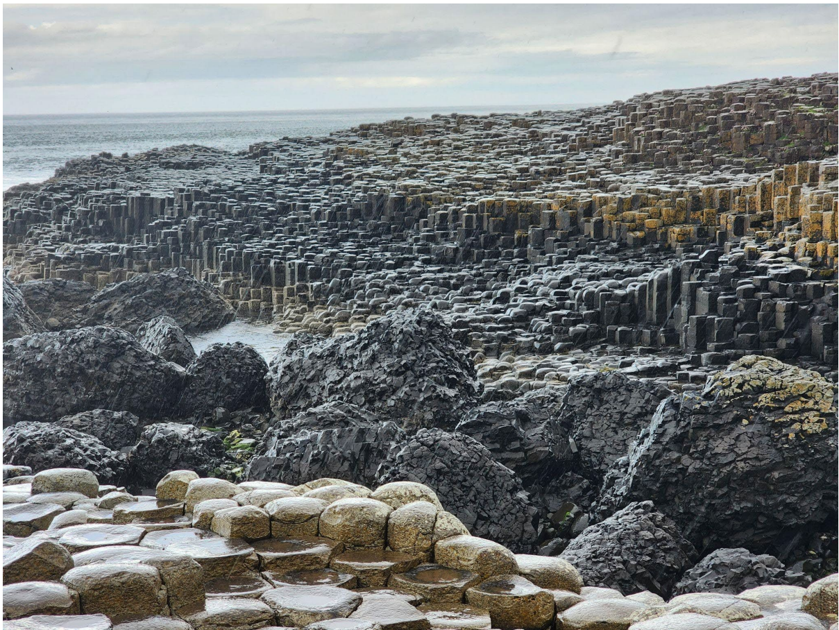
Figure 12: Columnar basalt at the Giant's Causeway.

On day seven, we first went for a hike at Slieve League, on the west coast. Later, following a long drive, we visited the Giant's Causeway UNESCO World Heritage Site on the northern coast of Northern Ireland. The outcrop is comprised of ~40,000 basalt columns that record the rifting and subsequent volcanism associated with the opening of the modern Atlantic Ocean. During the rifting of the continent Laurasia, large basaltic lava flows formed surficial lava "lakes" which slowly cooled to form the ~90 m thick sequence of columnar basalts now exposed along the Giant's Causeway. Various orientations of columnar basalts are visible and are indicative of the paleo-cooling direction of the lava. Additionally, an excellent example of modern spheroidal weathering of basalt is visible along the road leading to the main outcrop.