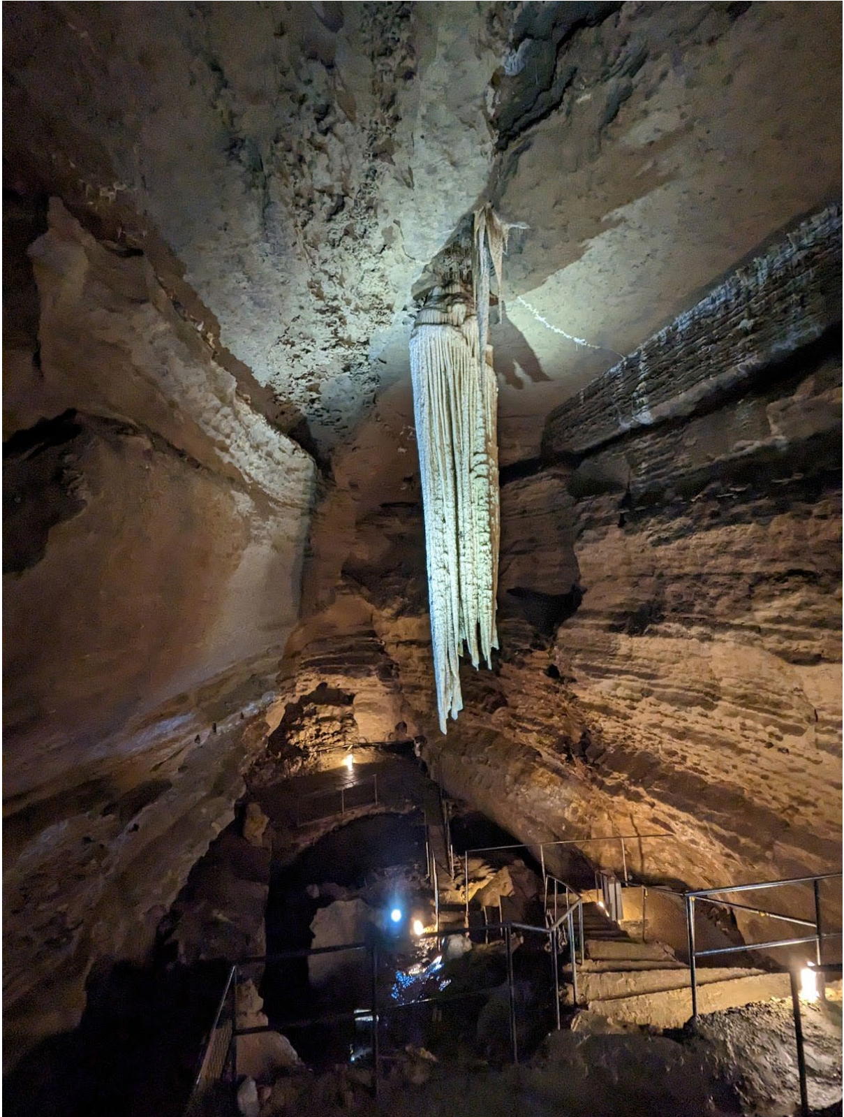
Figure 7: Largest stalactite in Europe and third largest in the world, Doolin Cave.