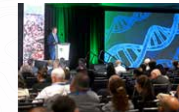
Speaker details to be announced.