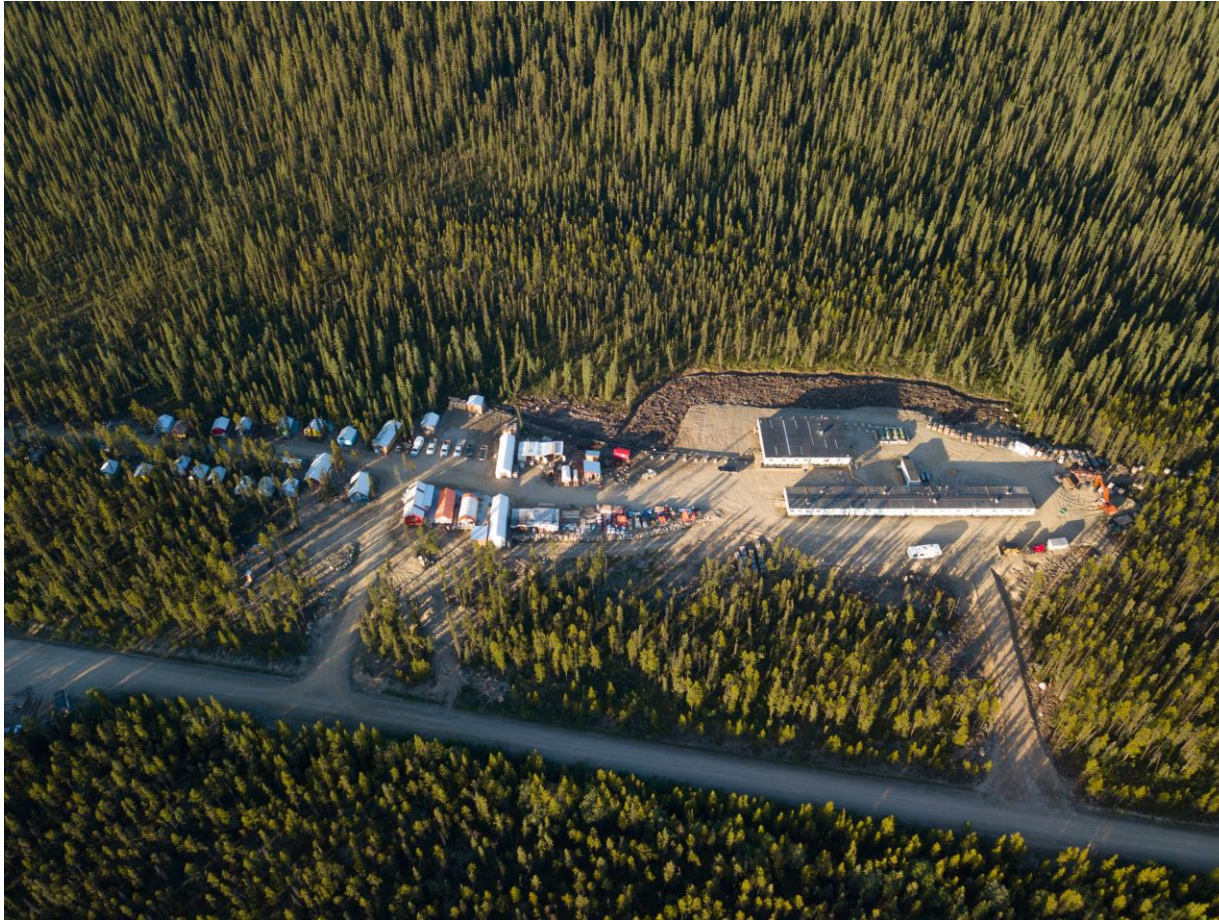
3 Aces Project Camp on the Nahanni Range Road