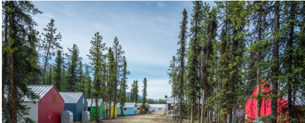
3 Aces Project Camp