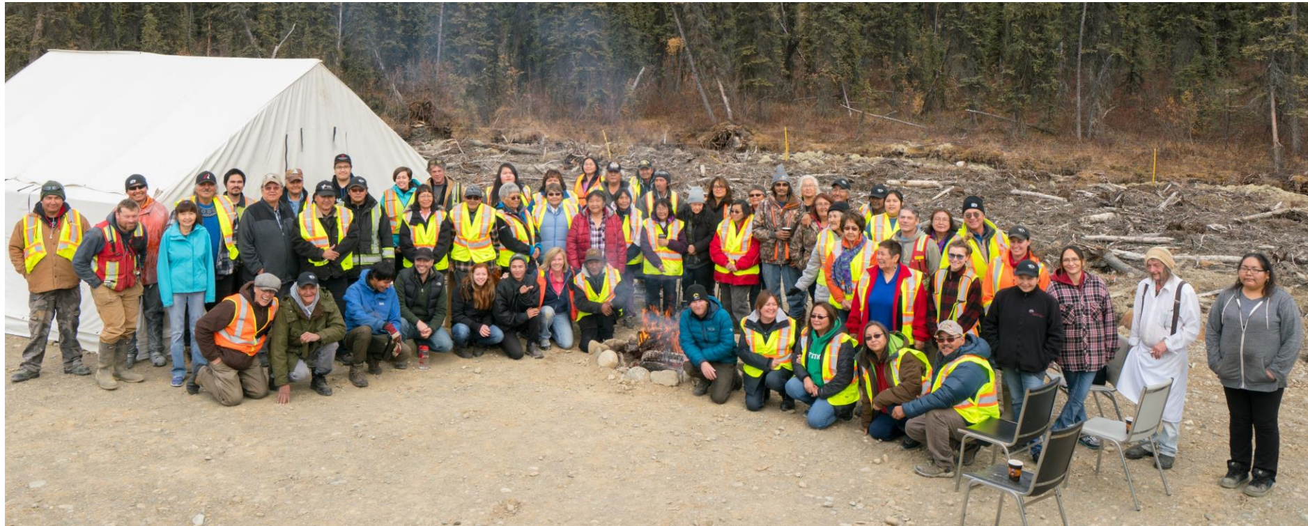
Meaningful Community Engagement and Involvement Elder/Youth Retreat at 3 Aces Camp – Fall 2018